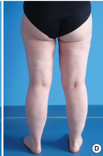
Fig. 4. Case example 2

A 65-year-old patient with stage III lipedema preoperatively (A) and 6 months after 3 liposuctions (B). A total of 11,600 mL of fatty tissue was removed from her legs.